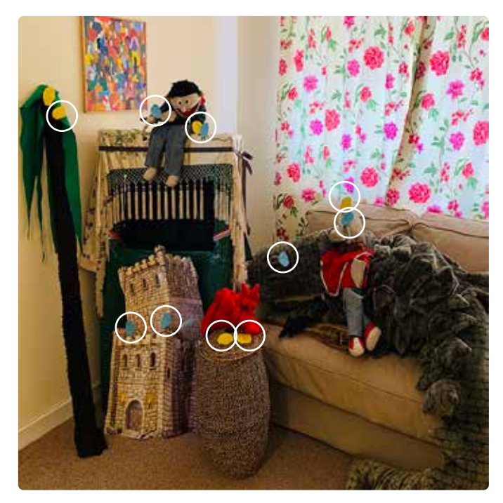
find the eggs page 3