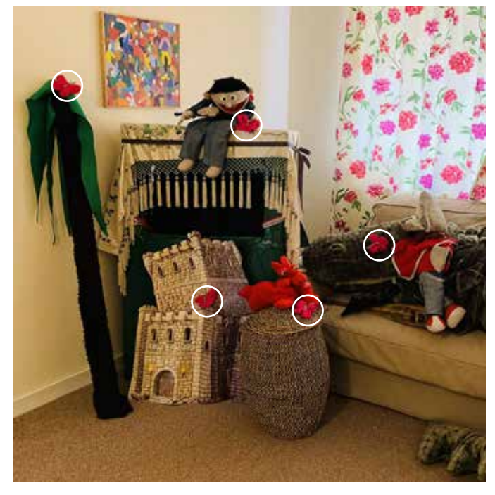
lost butterflies page 2