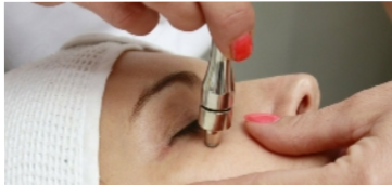
Diamond Tip Microdermabrasion