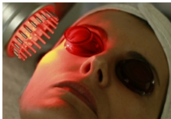
LED light Therapy