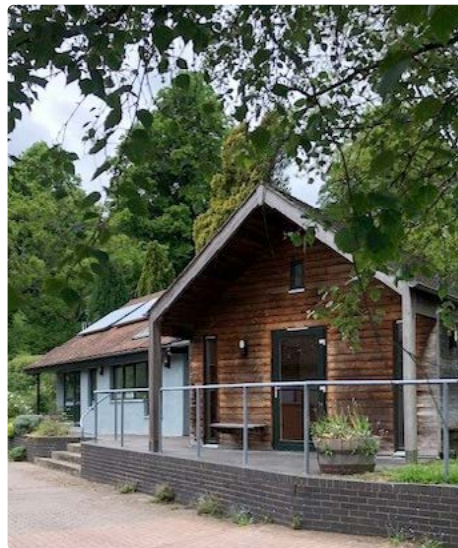
A beautiful new home ready to move into - thanks to your support!