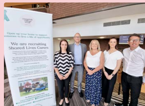
The Shared Lives team reaching even more people a year on