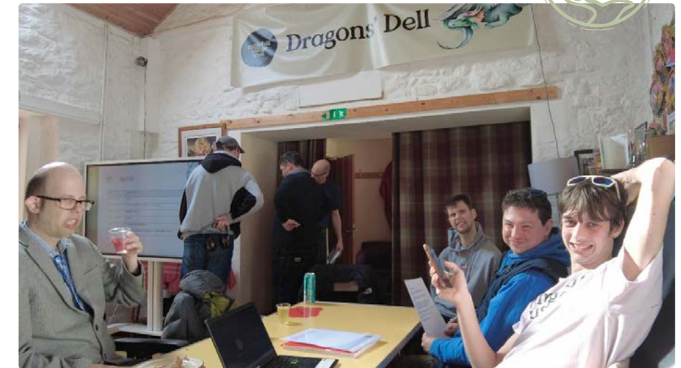
Communities working together to develop their green initiatives

There were 15 ideas pitched in total, and our green entrepreneurs bravely faced the dragons and answered their questions about the costs and possible benefits of their proposals. The successful ideas to be taken forward include a clothes swap shop at Delrow, a pop bottle greenhouse at Stourbridge and a composting project between Croft Community and local schools in Malton.