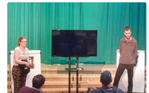
Communities proudly present their ideas to the probing 'dragons'

Our Green Teams will be reporting back at the Regional Forums in autumn, we can't wait to hear and update how these exciting projects are progressing.