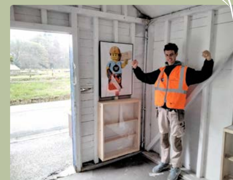
We've transformed Danby station with a lick of paint