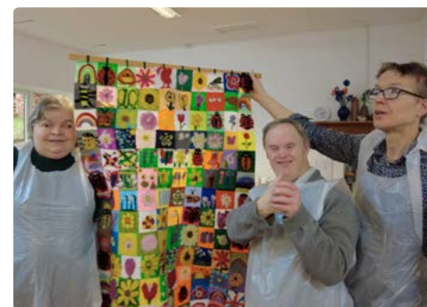
Our wall hanging symbolises the threads that keep us together

The wall hanging is now on display at the Weavery, where it can be enjoyed by community members and visitors alike.