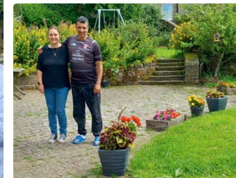
Some of the top entries and their beautiful outdoor spaces -including worthy winners the Creative Studio team. (Pictured bottom left.)