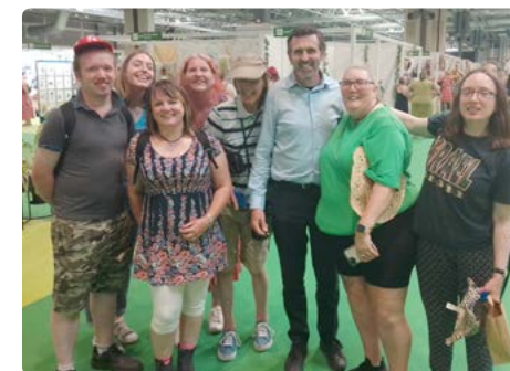
A highlight was getting to meet Gardeners' World star Adam Frost!

Our talented gardeners have seen their efforts win a gold award at this year's Gardeners' World Live show, with an exhibition stand featuring pollinating plants to encourage bees, moths and butterflies.