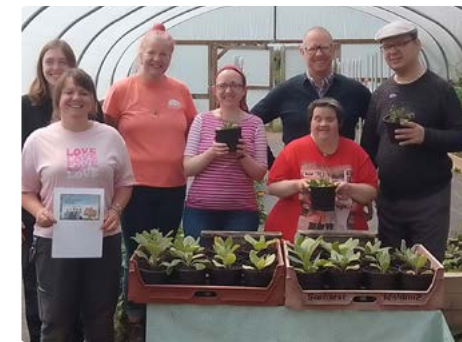
Everyone enjoyed getting involved with all the green-making activities.

Hosting the first planning meeting was an opportunity to connect with the many other local groups taking part. Next, community members had an exhibition stand at the launch event in a local park, where they enjoyed chatting to people. Later during the week, some of the people who attend Ashfield Gardens were also invited to attend a crafty Mindful Mums Hub to make butterfly feeders.