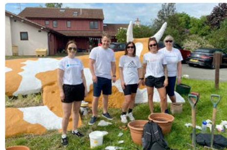
The Barclaycard volunteers getting stuck into some much-needed maintenance at Larchfield.