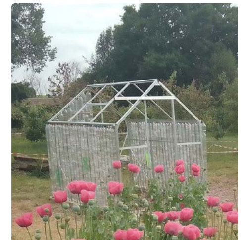
Hard work pays off. From a waste product to a space to grow fresh food!

'I am looking forward to seeing the greenhouse being used now, and to see things growing in there,' says Jenny. 'I hope we inspire others to do something similar with their recycled waste.'