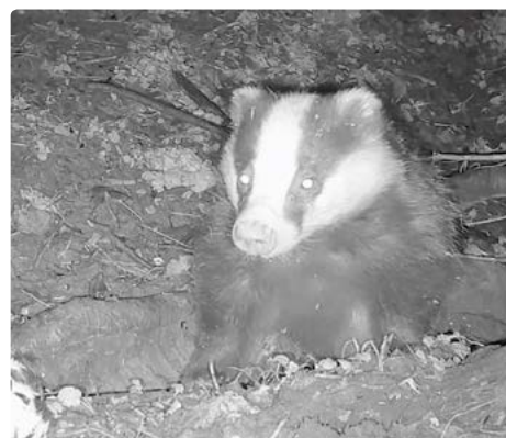
Just some of the wildlife already captured in our beautiful surroundings.